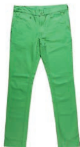
green ..... s