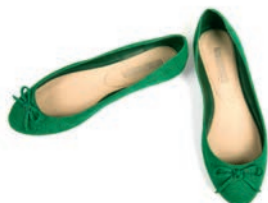
green ..... s