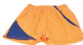
pant s (English)