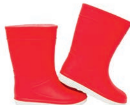
red boots s