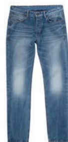
blue jeans s