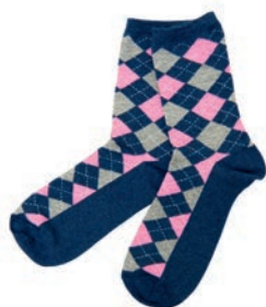
blue and pink sock s