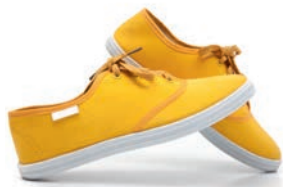
yellow sneaker s